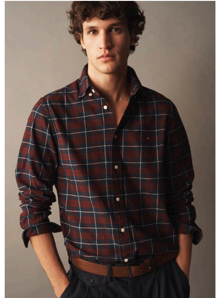
20 WOOL IVY JACKET Desert Sky | CABLE FLAG SWEATER Desert Sky | BRUSHED EASY CHECK SHIRT Deep Rouge | DENTON CHINO Desert Sky | CABLE BEANIE Beige | ESSENTIAL LEATHER BACKPACK Black | CHUNKY LEATHER CHELSEA Black