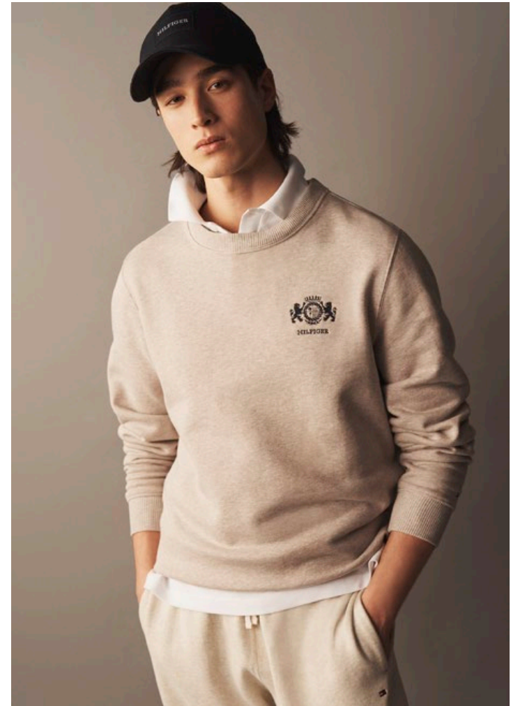
14 WOOL HERRINGBONE COAT Dark Grey Heather | SMALL CREST EMBROIDERED SWEATSHIRT Heathered Pebble | NEW REGULAR POLO White | ESSENTIAL FLEECE SWEATPANTS Heathered Oatmilk | NAVAL CAP Space Blue | CHUNKY LEATHER CHELSEA Black