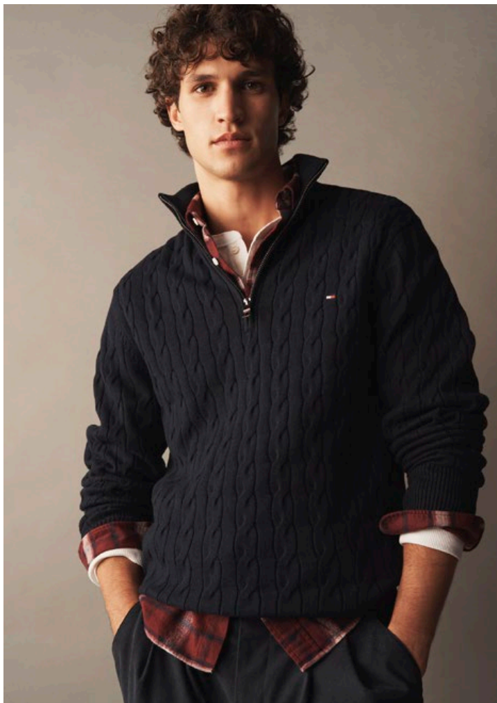
13 PREMIUM CLASSIC PEACOCK Desert Sky | CLASSIC COTTON CABLE ZIP MOCK Desert Sky | BRUSHED SHADOW CHECK SHIRT Deep Rogue | SLUB HENLEY LONG SLEEVE TEE White | DENTON CHINO Desert Sky | NAVAL CAP Space Blue | ESSENTIAL LEATHER BACKPACK Black | THUNIT PATENT LOAFER Black