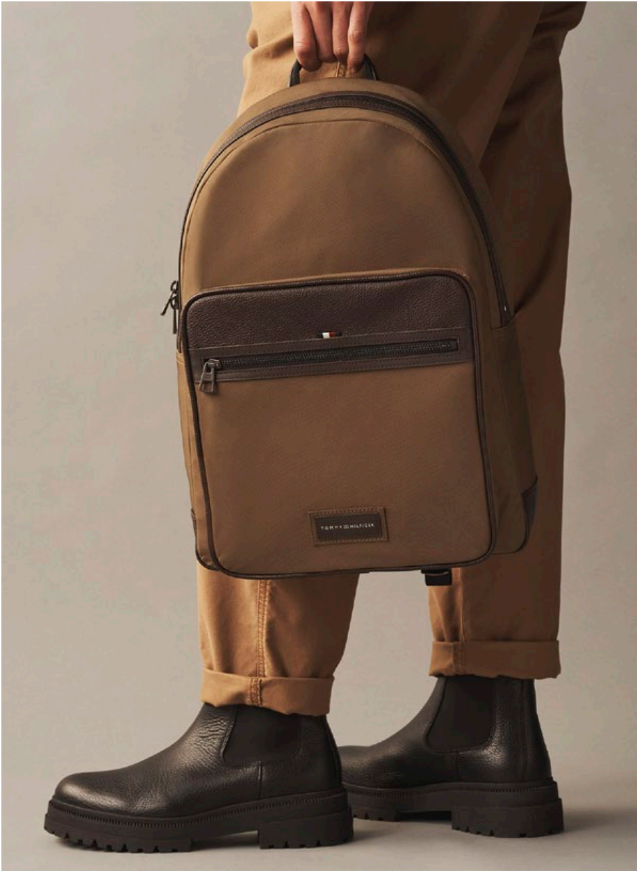
01 MEDIUM LEATHER DETAIL BACKPACK Tan Mix | CHUNKY LEATHER CHELSEA Black