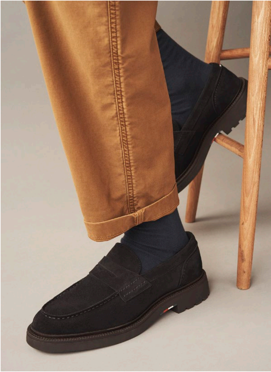
05 CHUNKY SUEDE LOAFER Black