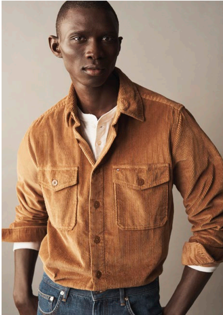
15 DOUBLE BREASTED OVERCOAT Dark Coffee | CORDUROY OVERSHIRT Highland Khaki | SLUB HENLEY LONG SLEEVE TEE White | SLIM BLEECKER DENALI INDIGO Denali Indigo | CHUNKY LEATHER CHELSEA Cocoa