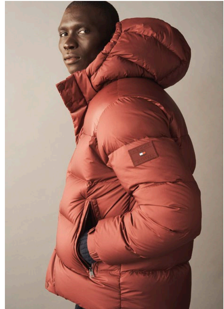
12 MIX DOWN HOODED PUFFER JACKET Deep Rouge | ALPACA BLEND STRIPE CREW NECK Desert Sky/Rouge | CLASSIC POPLIN STRIPE SHIRT Mid Blue/Optic White | HARLEM CHINO PLEAT WHITE CORDUROY Desert Sky | ESSENTIAL LEATHER WEEKENDER Black | CHUNKY LEATHER LACE UP BOOT Black