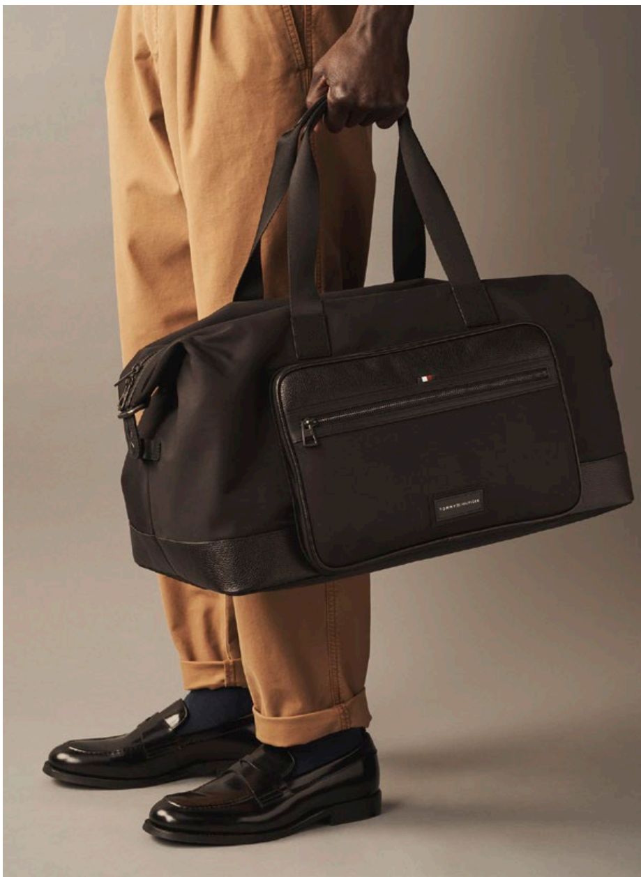
03 ESSENTIAL LEATHER DUFFLE BAG Black | THUNIT PATENT LOAFER Black