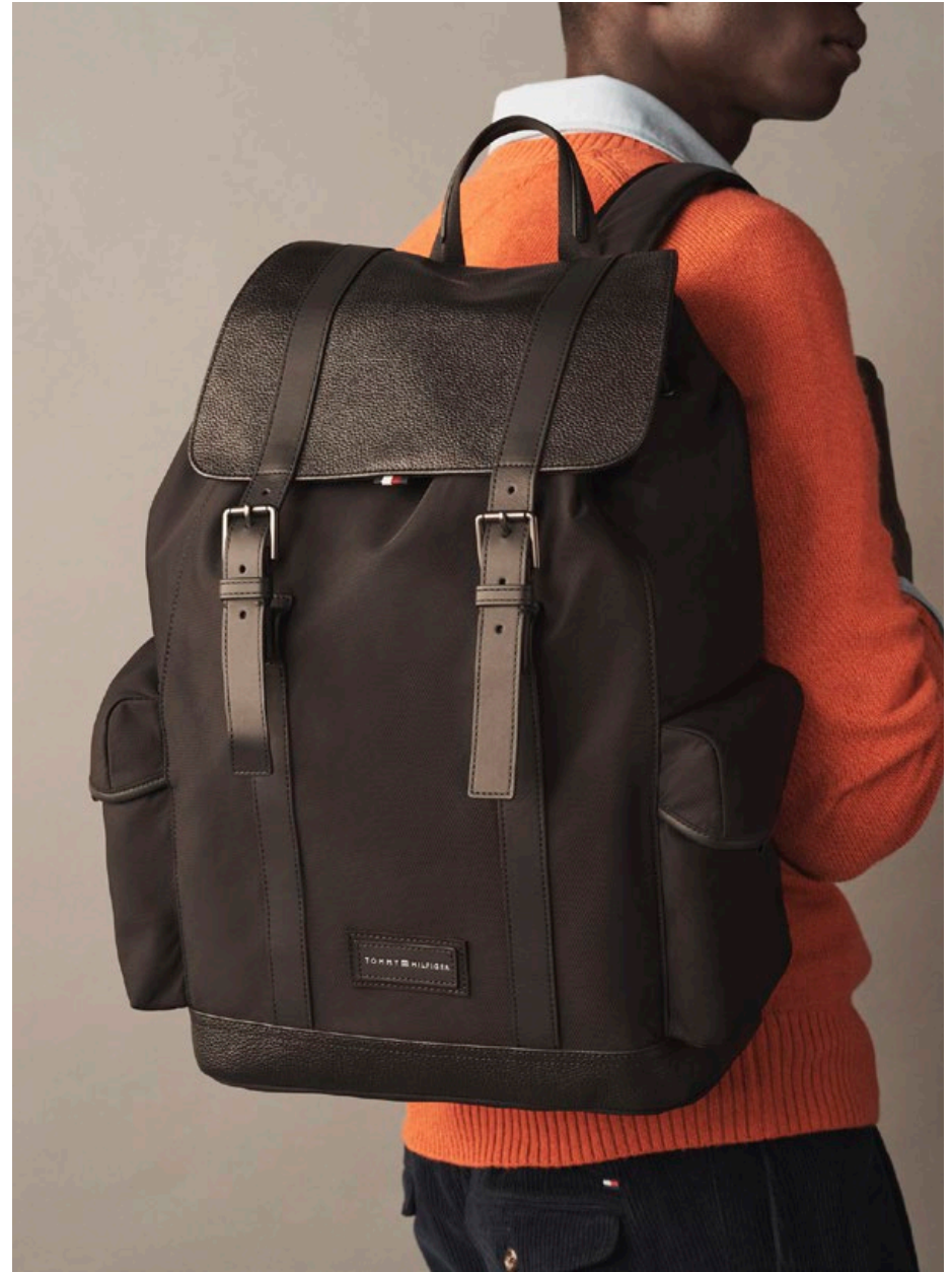
02 ESSENTIAL LEATHER BACKPACK Black