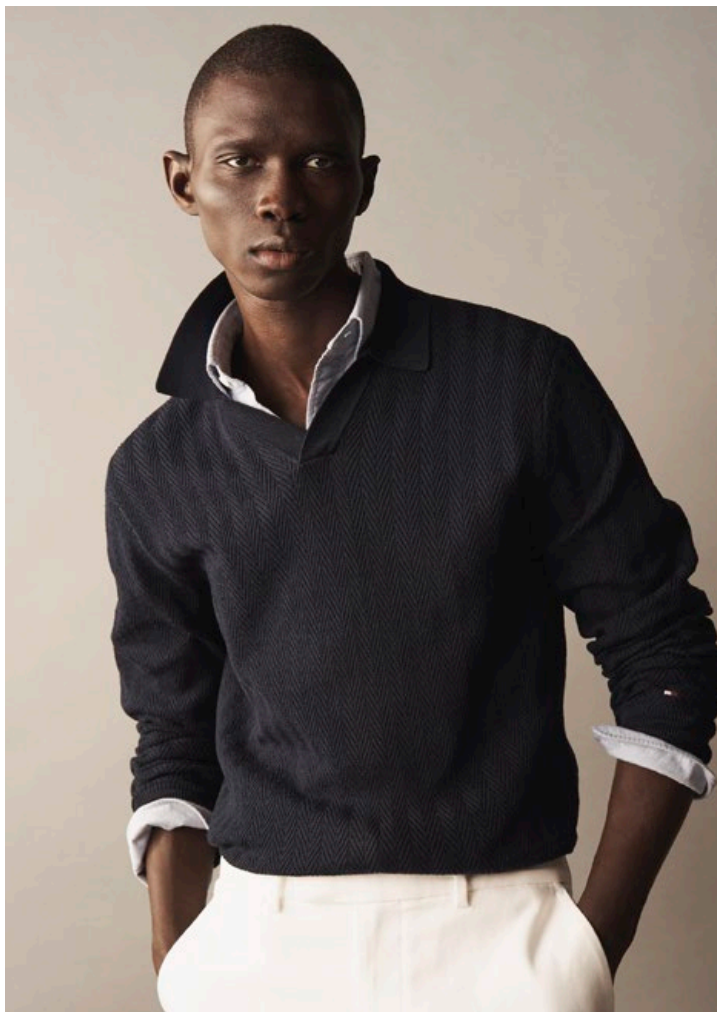
09 FLANNEL BLAZER Desert Sky | SOLID HERITAGE OXFORD SHIRT Royal Blue | MERCERISED STRUCTURE LONG SLEEVE POLO Desert Sky | DENTON CLEAN CHINO Ecrú | THUNIT PATENT LOAFER Black