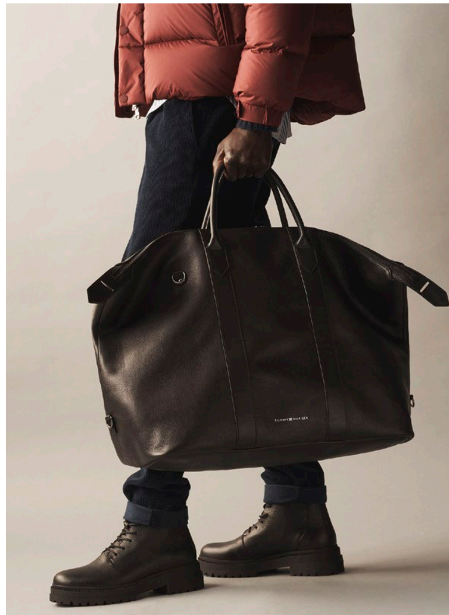
04 ESSENTIAL LEATHER WEEKENDER Black | CHUNKY LEATHER LACE UP BOOT Black