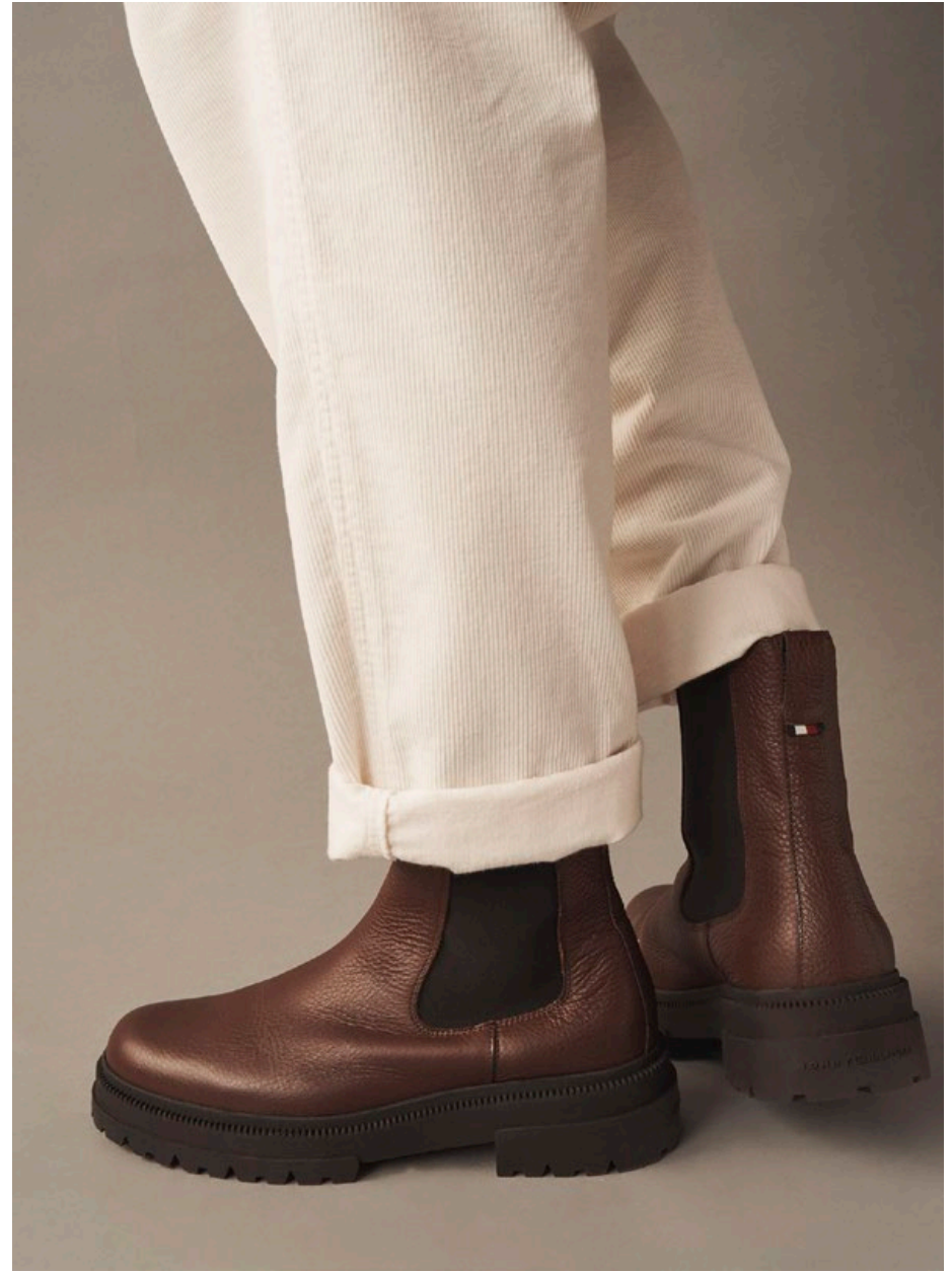
06 CHUNKY LEATHER CHELSEA Cocoa