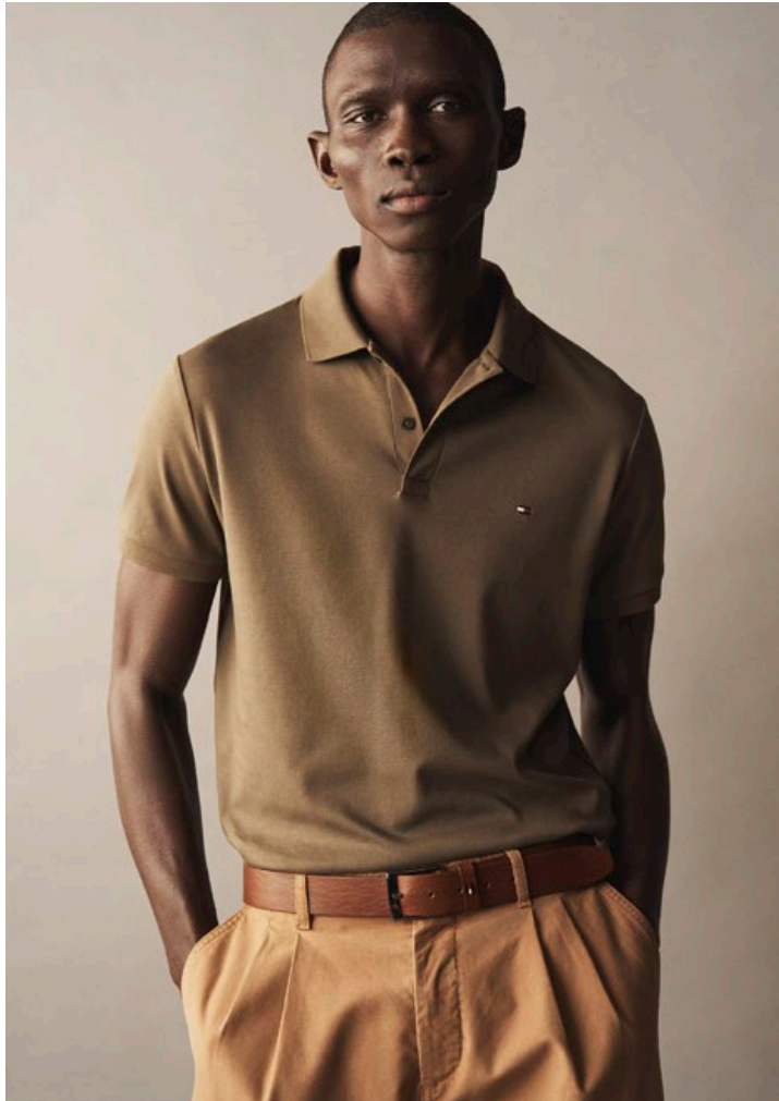
07 MONOTYPE HEAVY TWILL HOODY Heathered Pebble | LIQUID COTTON ESSENTIAL REGULAR POLO Army Green | ESSENTIAL SOLID POCKET TEE Desert Sky | CHINO HARLEM GABARDINE Safari Canvas | ESSENTIAL LEATHER DUFFLE BAG Black | THUNIT PATENT LOAFER Black