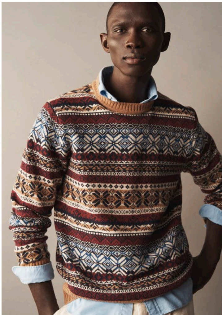
19 ROOKIE DOWN PARKA Ivory | GIFTING WOOL BLEND FAIRISLE CREW NECK Safari Canvas | FLEX BRUSHED SOLID SHIRT Vessel Blue | HARLEM CHINO PLEAT WIDE CORDUROY Ivory | WOOL LOGO SCARF Space Blue | CHUNKY LEATHER CHELSEA Black