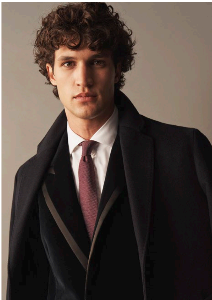
21 CASHMERE COAT Desert Sky | SOLID POLIN SHIRT Optic White | CASHMERE PANTS Desert Sky | THUNIT PATENT LOAFER Black